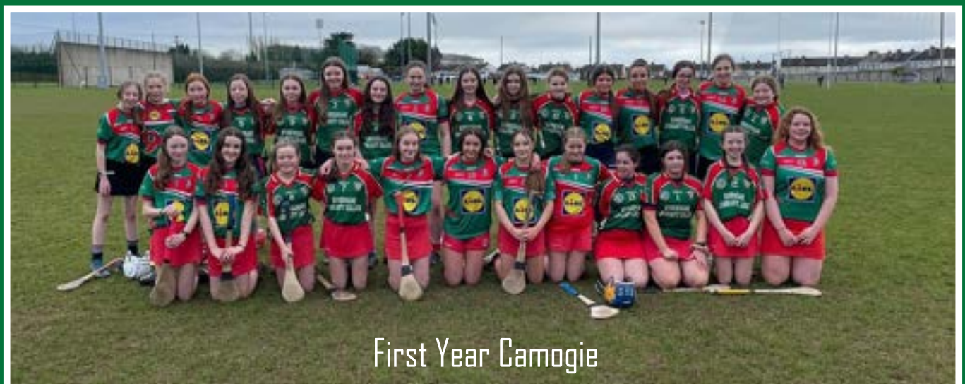
First Year Camogie