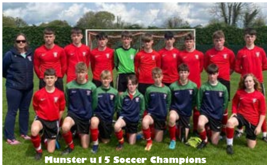
Munster u15 Soccer Champions

Wellread Readers for Life: Borrisokane Community College is now a Wellread Readers for life School. This award is due to the many initiatives undertaken by the school community to get everyone reading.