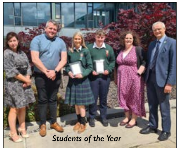
Students of the Year

This is a group of students who volunteer to work with our new First Years each year. This group of about twenty students assist with First Year Induction Day and act as mentors and friends to First Years as they settle into the routine of Borrisokane Community College. They also organise and participate in activities for First Year students.