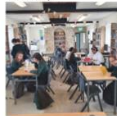
Image: Students reading in the library

We plan to add some textbooks for study and possibly expand our collection of popular books. This grant will certainly be the bringer of good news for all those who use the library.