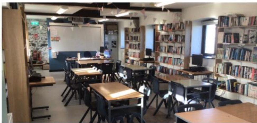
Image: Our library, built in 1850 as a workhouse, restored only in recent years