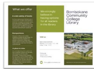
Image: Front side of new brochure being drafted by BCC Library Committee

The brochure will be produced in a modern, interesting and eye-catching manner, to display the library's best features. The brochure will display the creativity of the Library Committee, and their desire to promote the benefits of using our library as well as what the library is about.