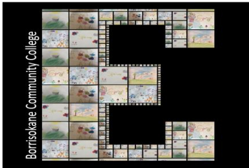
BCC Spring Pictures